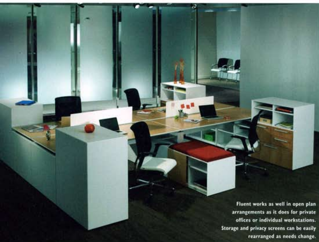
Fluent works as well in open plan arrangements as it does for private offices or individual workstations. Storage and privacy screens can be easily rearranged as needs change.