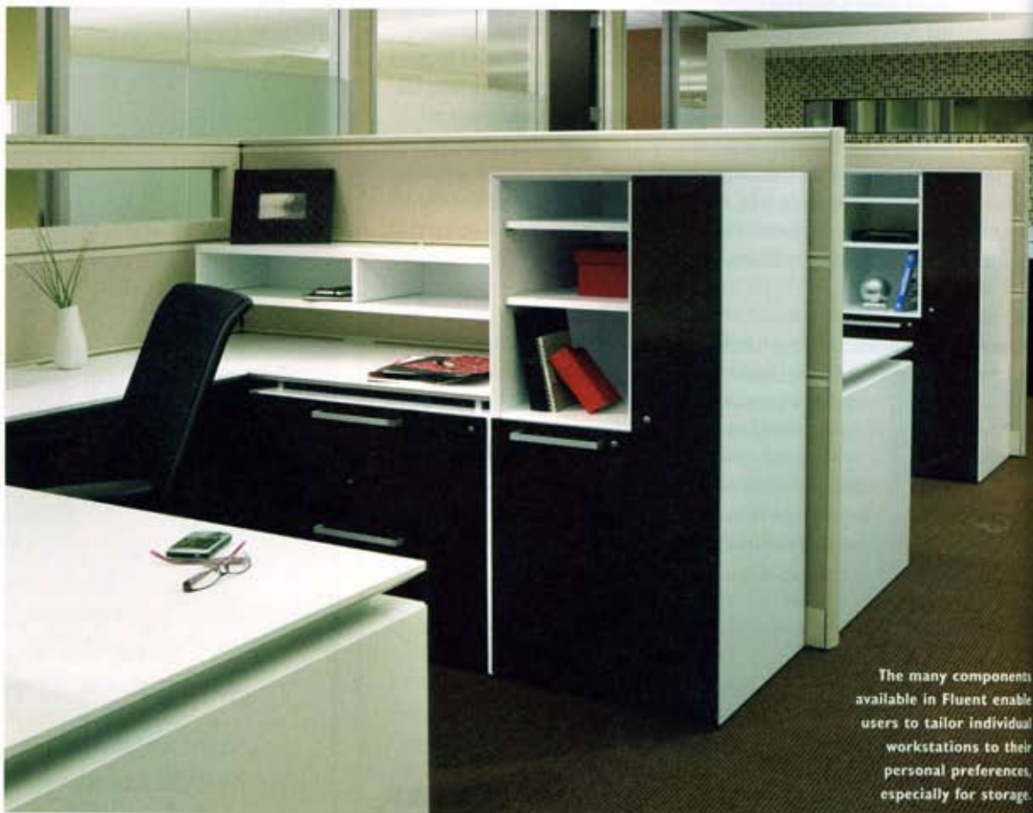
The many components available in Fluent enable users to tailor individual workstations to their personal preferences, especially for storage.

Fluent, the result of a collaboration between Kimball Office and designer David Allan Pessa, provides a sophisticated, contemporary furniture solution that is perfect for use in any office environment.