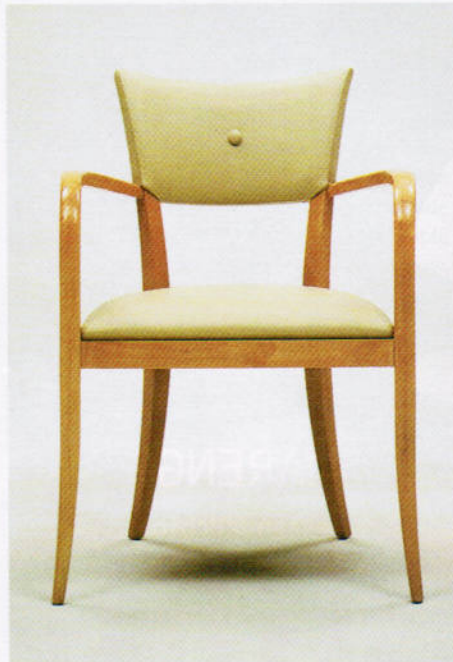
Ayrton Guest Chair