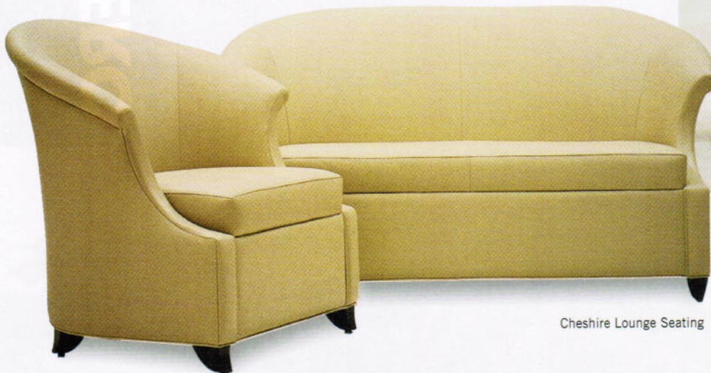
Cheshire Lounge Seating